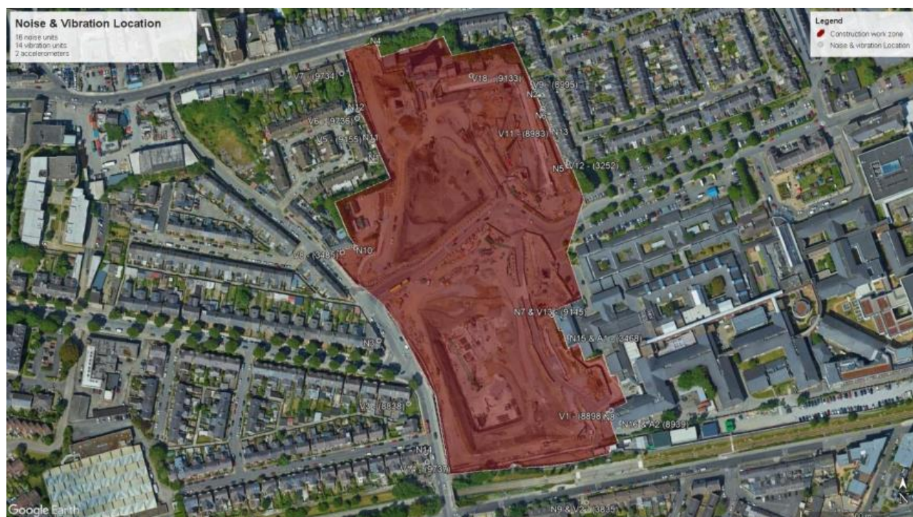
Location of Vibration Monitors

The layout of the monitors is as seen below: