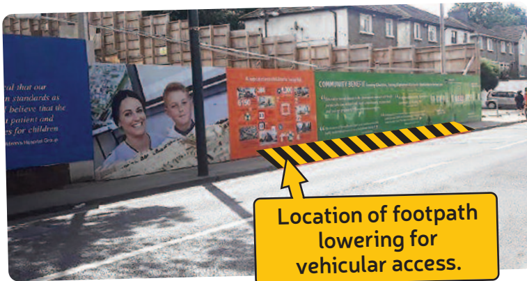
Location of footpath lowering for vehicular access.

When the hospital is operational, there are plans to provide a signalised pedestrian crossing on Mount Brown.