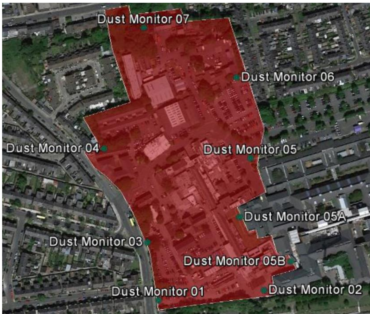
Figure 3. Previous location of Dust monitors on site (April 2017 to August 2017).