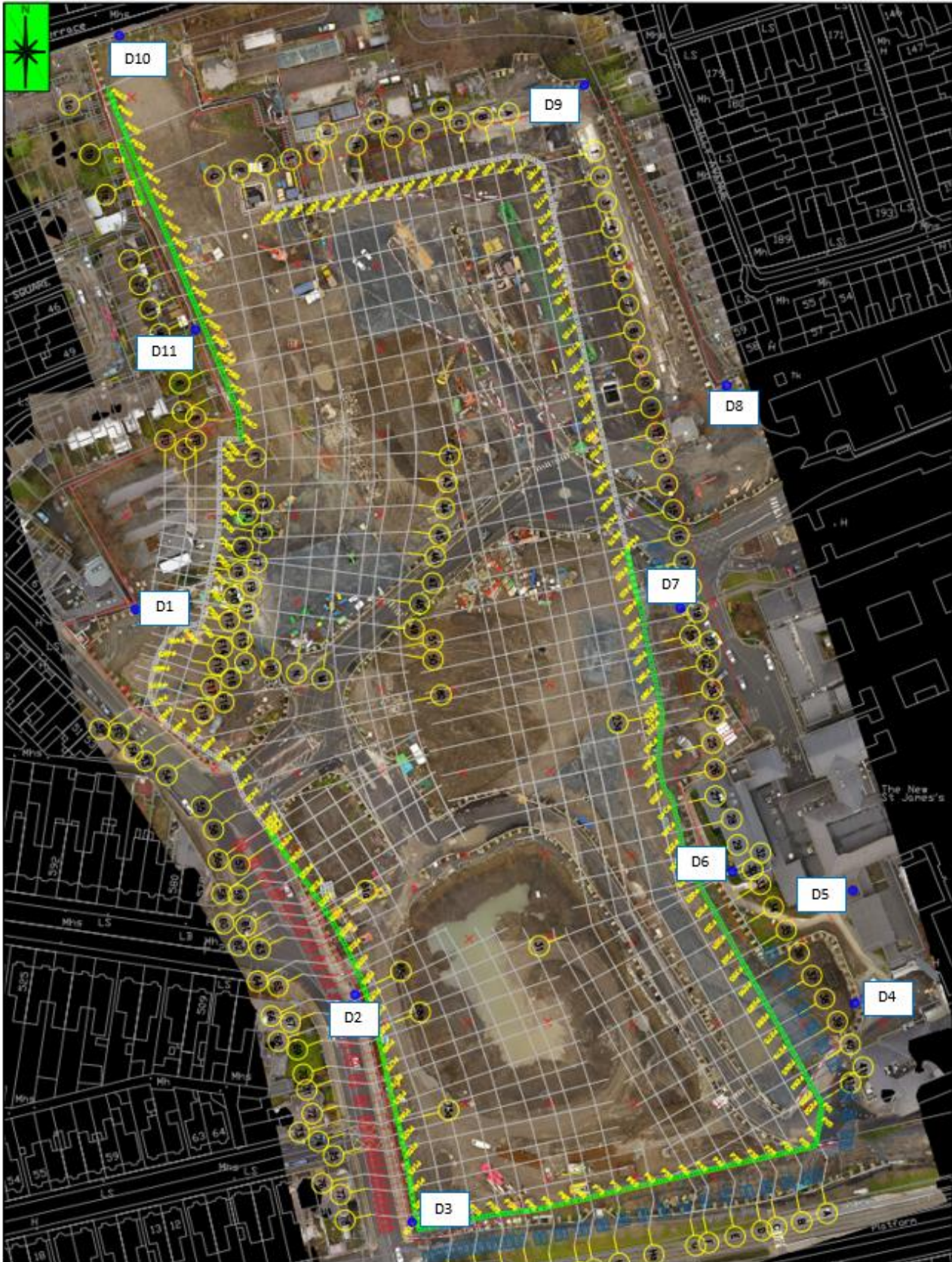
Figure 1. Location of Dust monitors on site (May 2018).