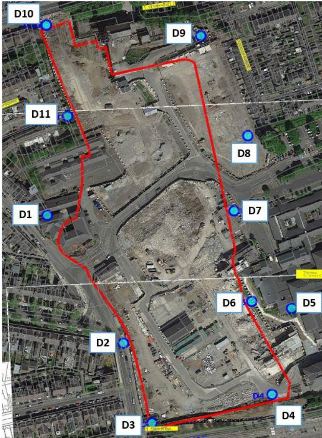
Figure 2. Location of Dust monitors on site (September 2017 – April 2018).