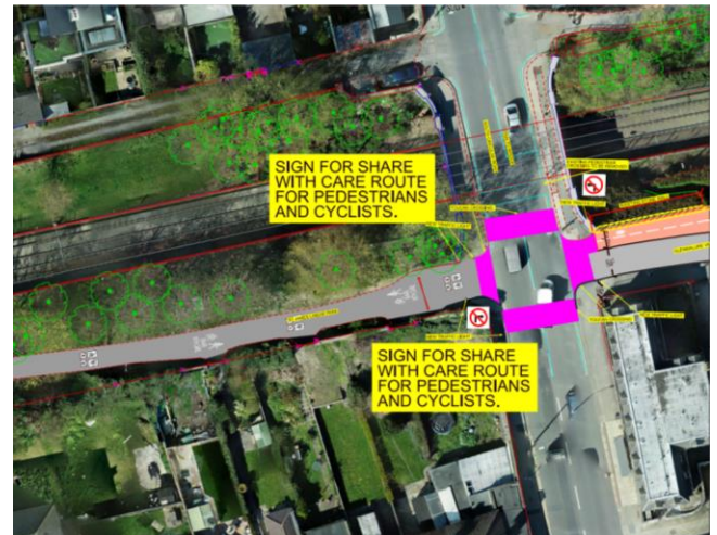
Figure 2 Rialto Bridge

The crossing from one section of the Linear Park to the other is illustrated in the photo below with new traffic lights and reorganisation of the junction.