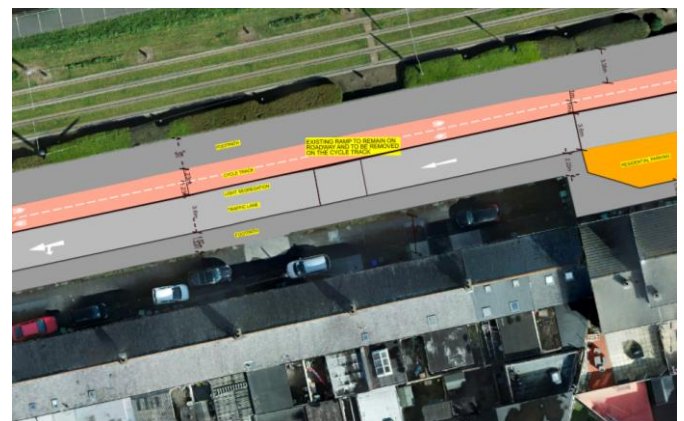
Figure 3 James's Walk Rialto St

The proposed cycle route will then run along James's Walk on the road in both directions while the road itself will become one way , running east to west towards Rialto Bridge.