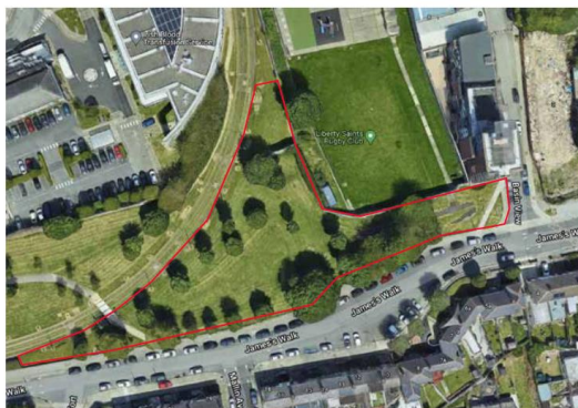
RED LINE BOUNDARY

The works are due to re-commence shortly.