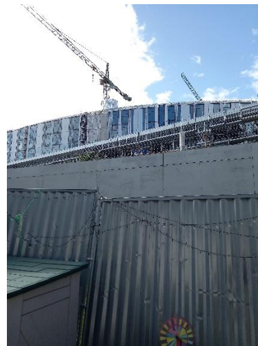
Figure 1 Back garden O'Reilly Avenue

For five years residents have had a section of their gardens removed with a steel fence boundary and beyond that a large 20 ft hoarding along the boundary of the site. See picture below.