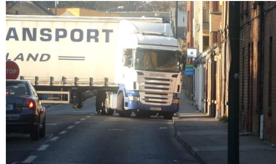
Figure 2 Mount Brown 19th Nov

The sign will probably be erected by Thornton’s Garage giving drivers a clear stretch to see their speed and adjust it accordingly before the junction.