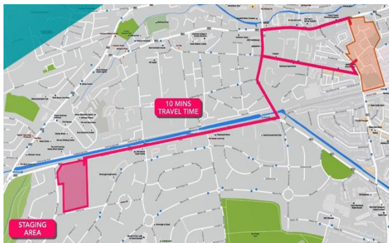
Map details the location of the Davitt Road Staging Area relative to Saint James's Hospital.

The map above show the access roads to and from the site, no lorry should approach or leave the site using roads other than the ones indicated above. If residents see lorries using alternative routes they should contact