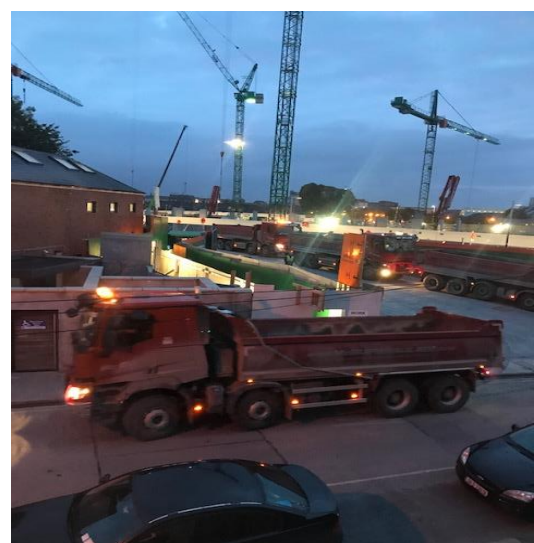
Figure 1 Rialto Gate October 6:55am

BAM Construction Management Plan Lodged with DCC Aug 2019