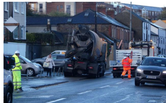
Figure 3 Recent photograph Mount Brown

“The Mount Brown gate and management of it is an accident waiting to happen” said an agitated Mount Brown Resident. “There have been changes made to Gate 5, it is having an impact on the road outside our house. As the entrance is much smaller, the trucks are having to wait to get access to the site, they are blocking the footpath which is causing problems. I’m concerned that there will be another accident involving a cyclist or a pedestrian.”