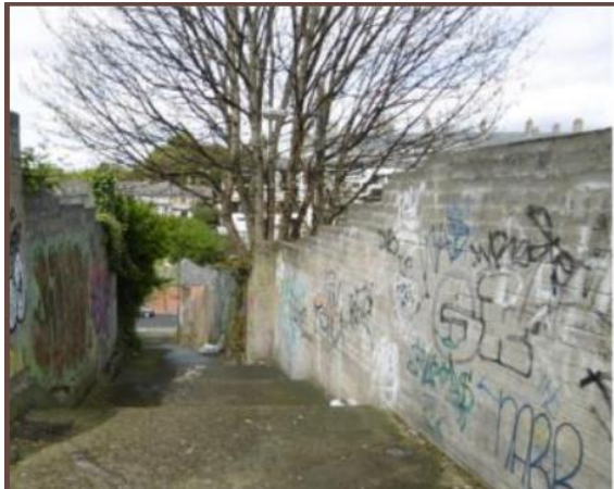
Figure 1 Existing steps

Cameron Sq step upgrade includes a major refurbishment of current steps including the resetting of new steps on existing ones, the removal of current wall on the hospital side opening up the landscaped garden and the inclusion of lights .